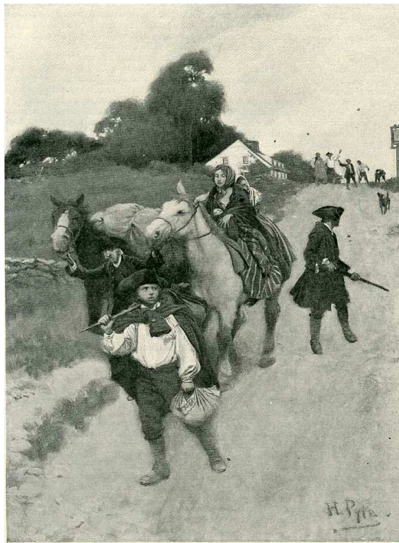
In "Tory Refugees" Pyle depicts loyalists fleeing north, an often ignored facet of the American Revolution, but one that touched Wilmington, Del.